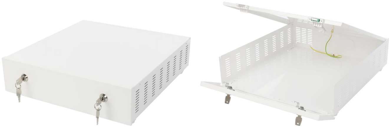
Figure 2. View of enclosure.