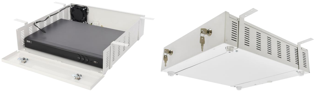
Figure 3. Sample assembly – Fan ARAW45 / recorder / Mounting AWO445BR

Pulsar sp. j. Siedlec 150, 32-744 Łapczyca, Poland Tel. (+48) 14-610-19-45 e-mail: sales@pulsar.pl http:// www.pulsar.pl