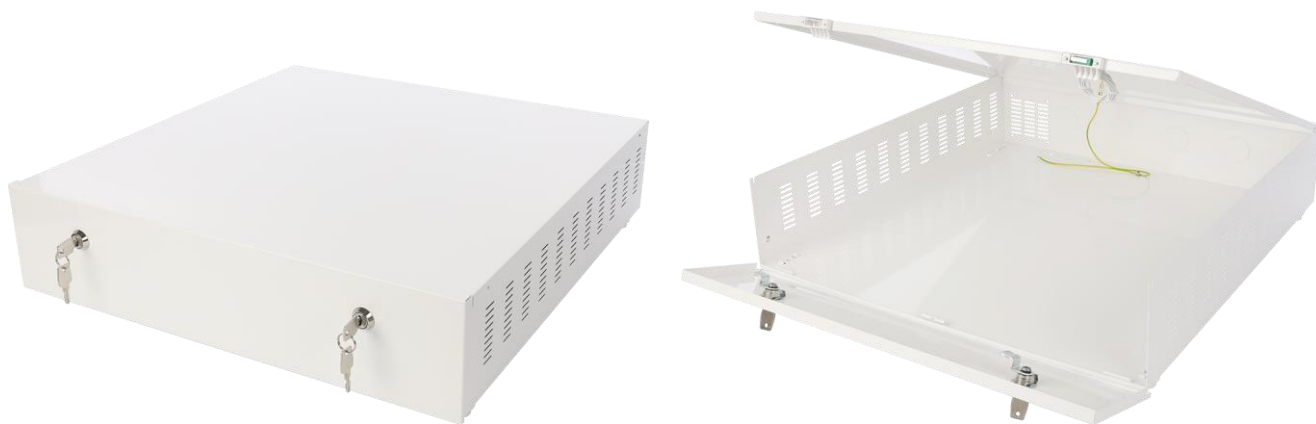
Figure 2. View of enclosure.