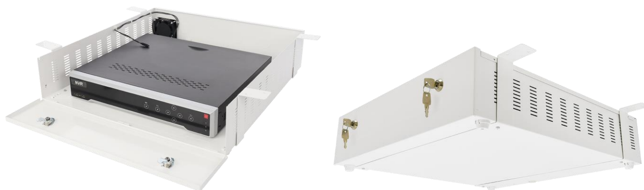
Figure 3. Sample assembly – Fan ARAW45 / recorder / Mounting AWO471BR