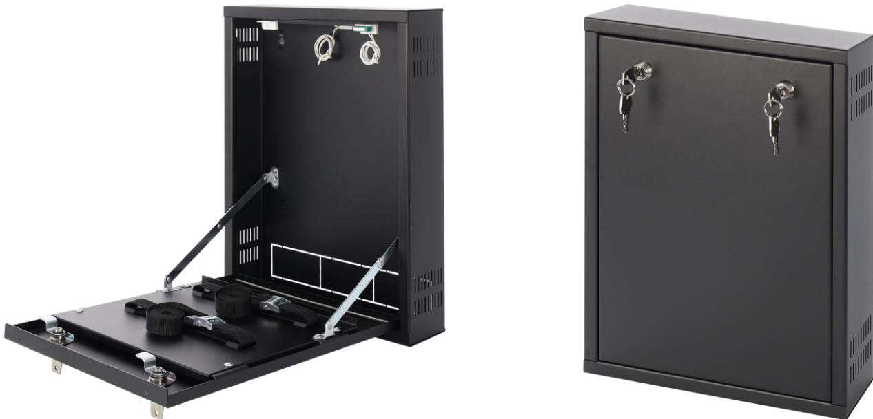
Figure 2. View of enclosure.