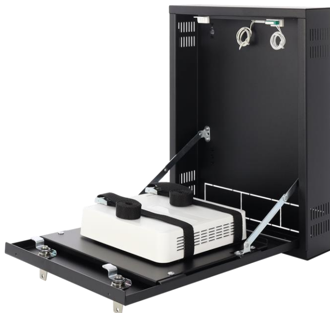
Figure 3. Sample assembly – recorder