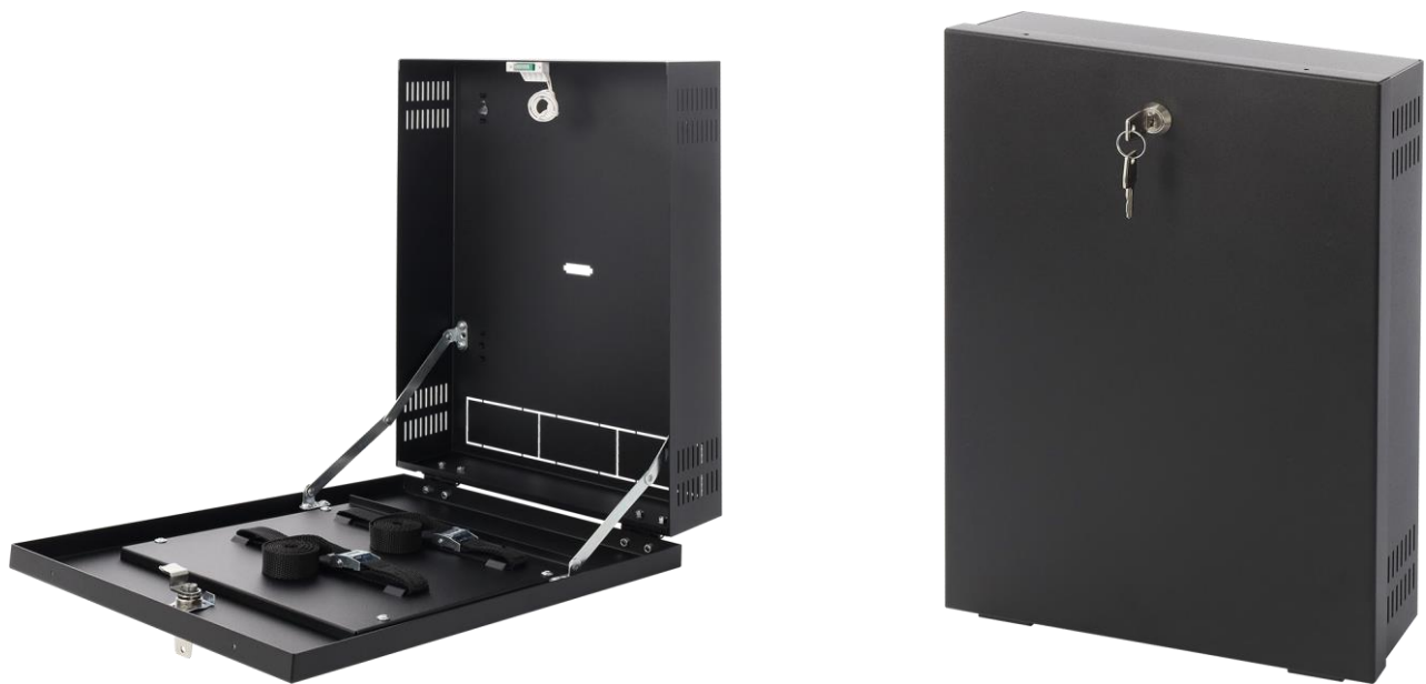
Figure 2. View of enclosure.