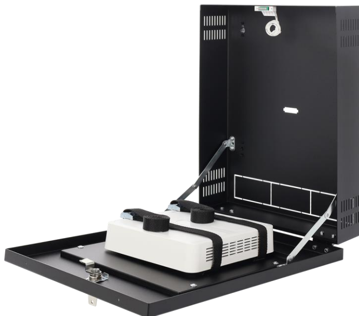
Figure 3. Sample assembly – recorder