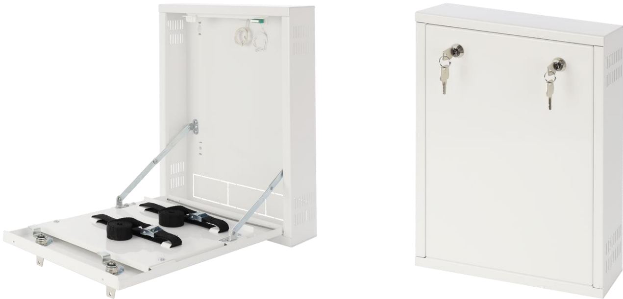
Figure 2. View of enclosure.