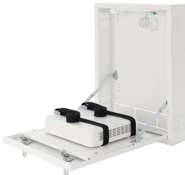
Figure 3. Sample assembly – recorder