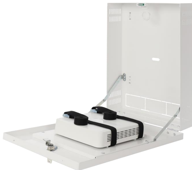
Figure 3. Sample assembly – recorder