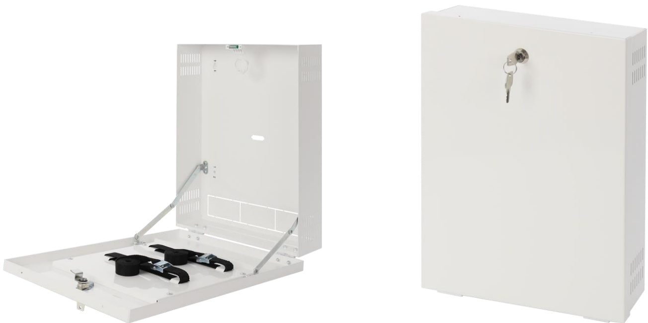
Figure 2. View of enclosure.