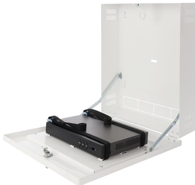
Figure 3. Sample assembly – recorder