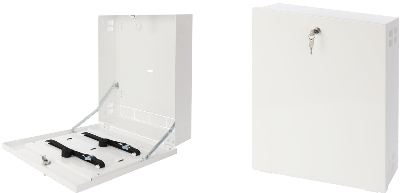
Figure 2. View of enclosure.