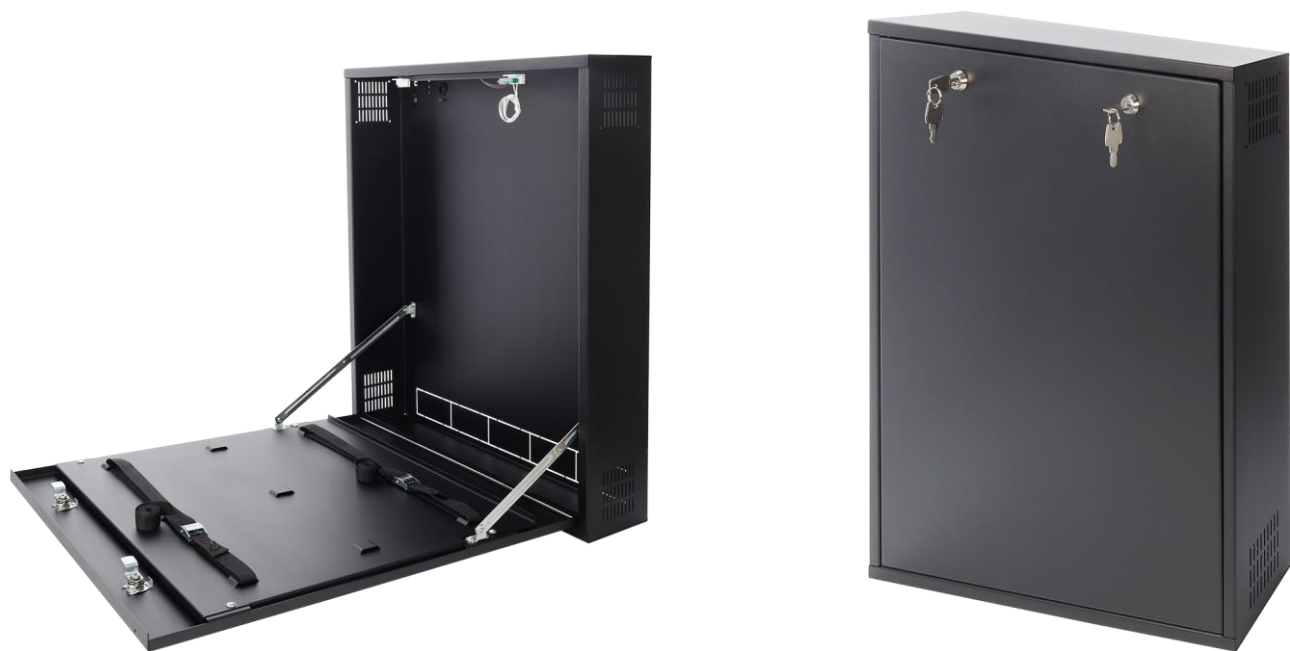
Figure 2. View of enclosure.