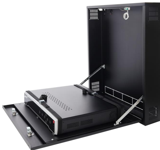
Figure 3. Sample assembly – recorder