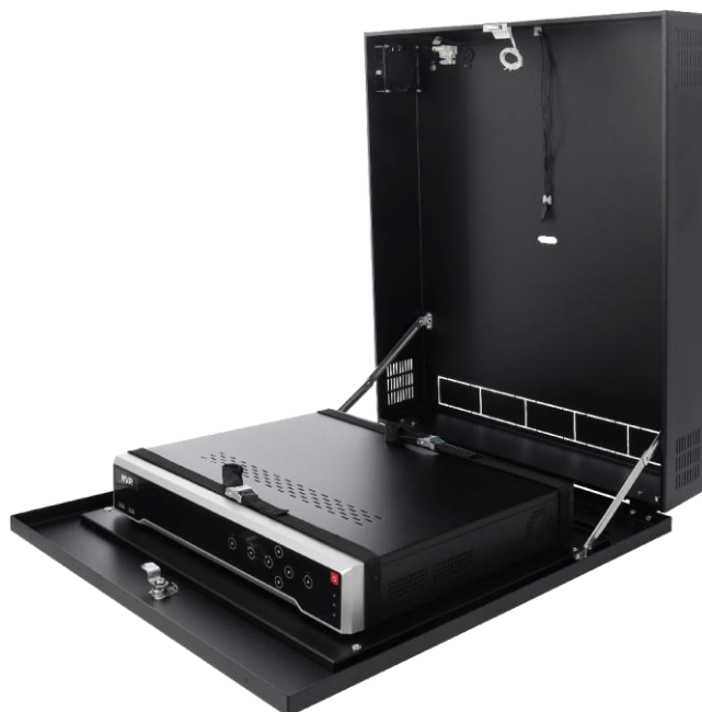
Figure 3. Sample assembly – recorder