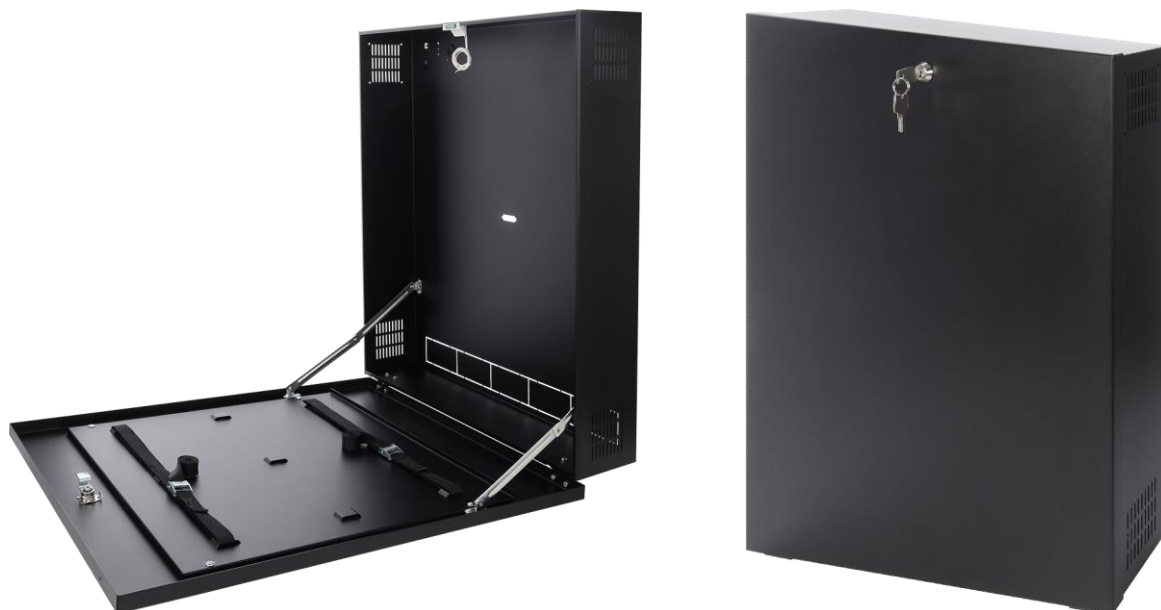
Figure 2. View of enclosure.