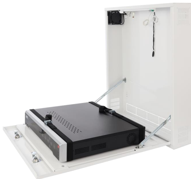
Figure 3. Sample assembly – recorder