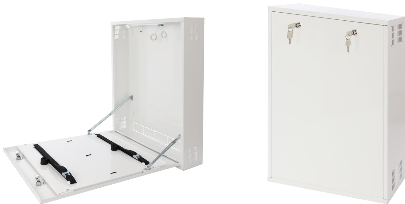
Figure 2. View of enclosure.