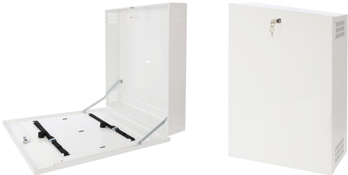
Figure 2. View of enclosure.