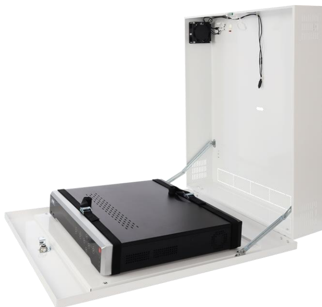
Figure 3. Sample assembly – recorder