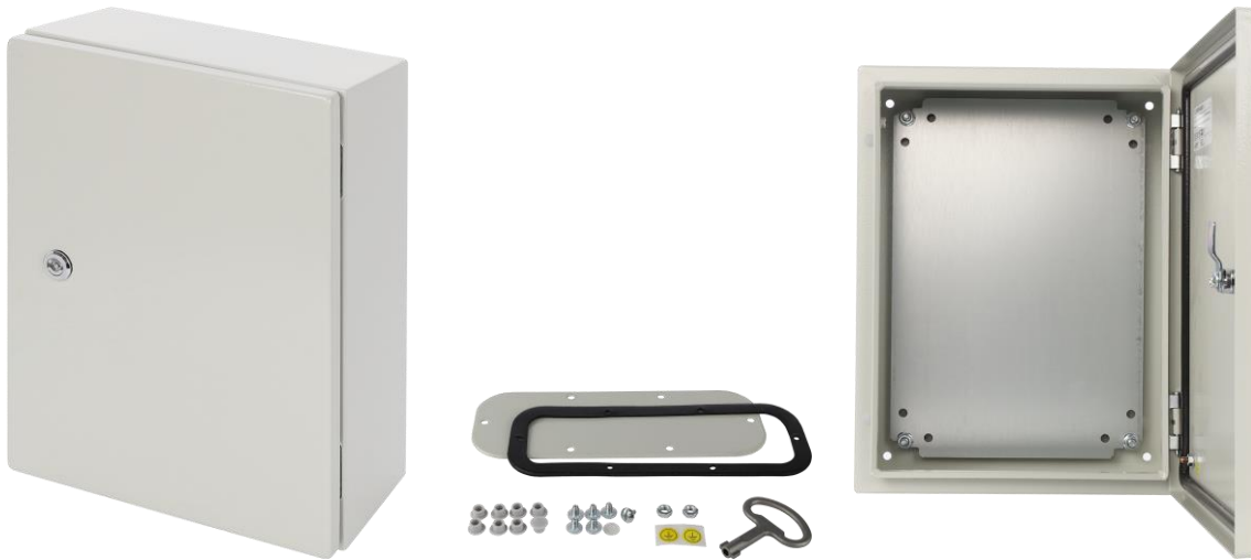
Fig. 1. View of enclosure.