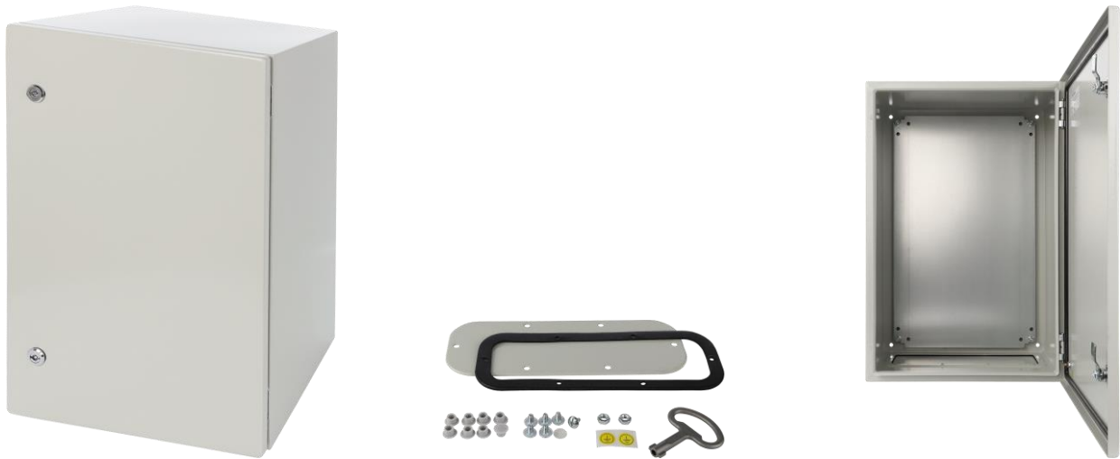
Fig. 1. View of enclosure.