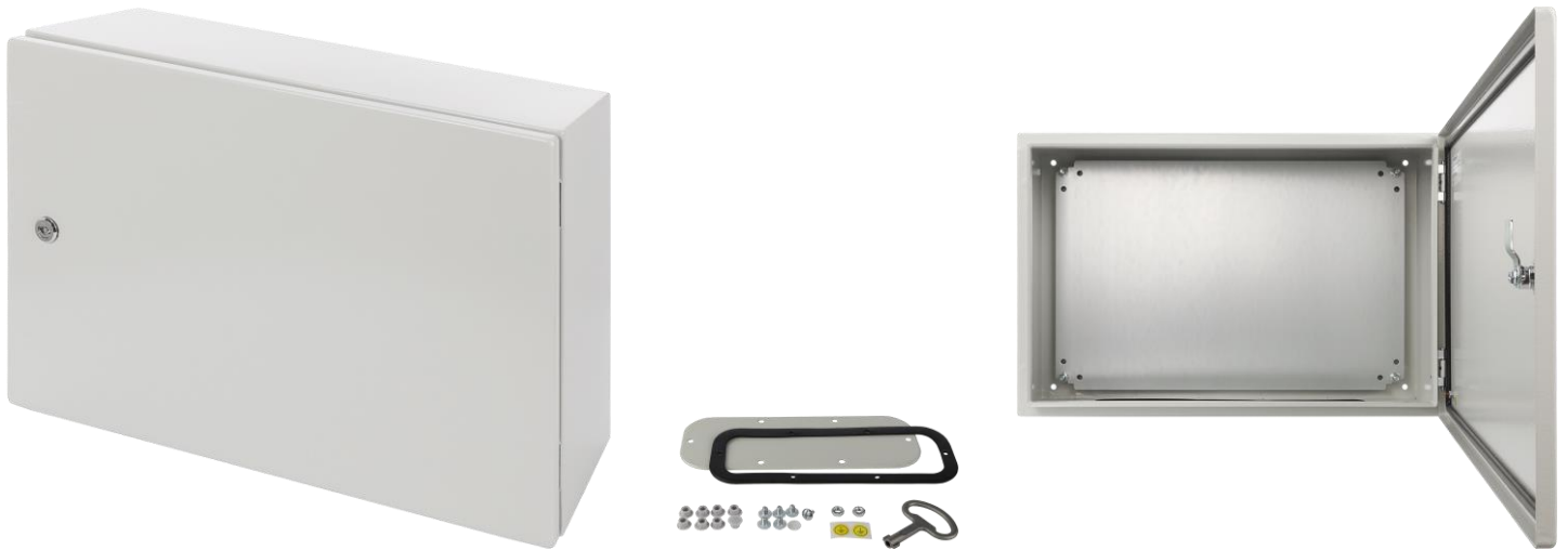
Fig. 1. View of enclosure.