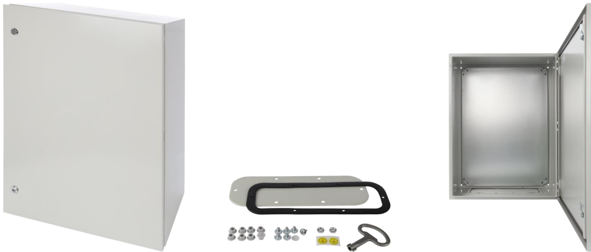
Fig. 1. View of enclosure.