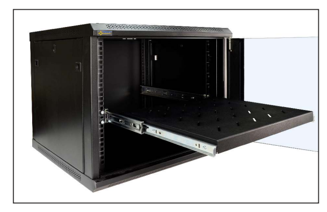
Full-extension slide of the shelf