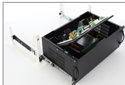
Mounting on a ARAS450N rail