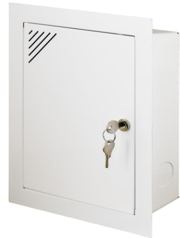
Flush mounted type