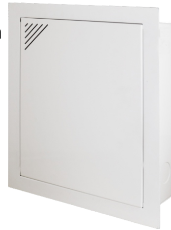
Flush mounted type