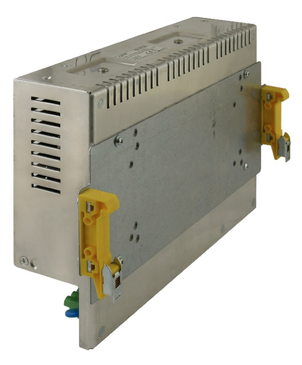
Caution! power supply unit is not included